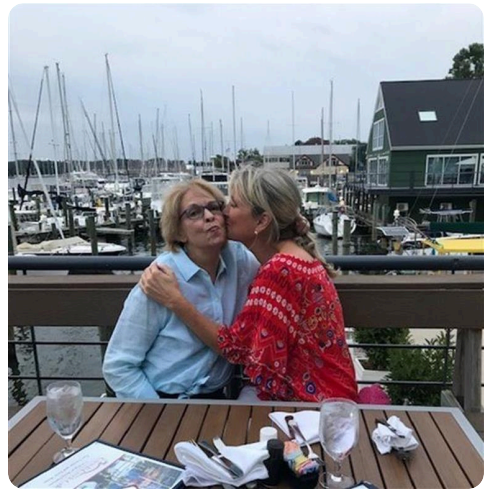
Love you so much!