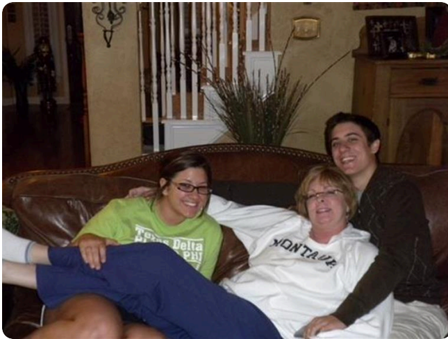
Will always be Aunt Sandy to my kids