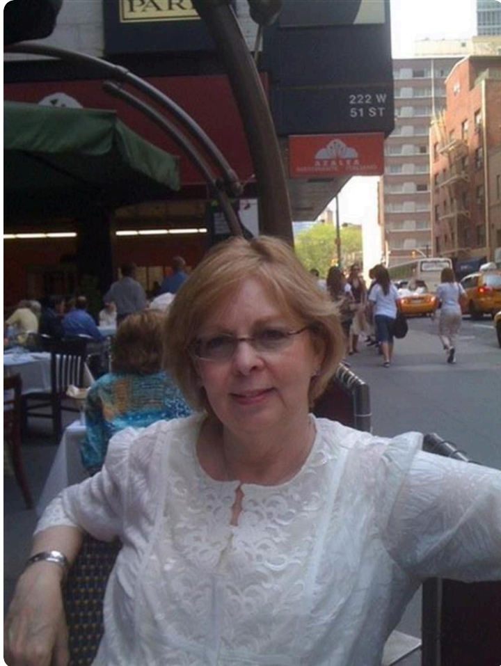
One of our trips..